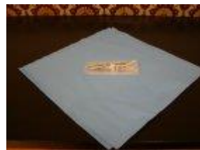
or Autoclave paper