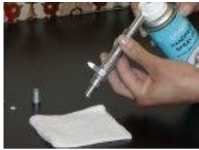
Spray with Lever Open