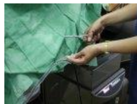
Secure to drape