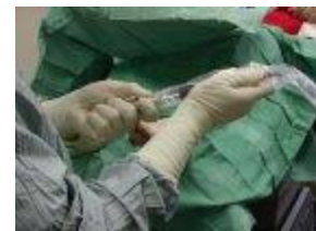
Attach to handpiece