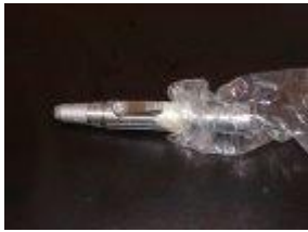
Secure with tape