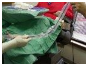
Threading motor & cord