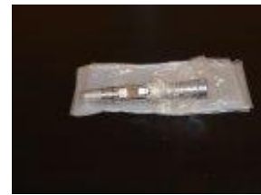
Ready for sterilization