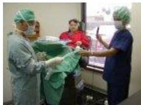
OR set up