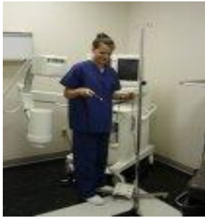
Osada Pedo 30