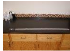
Nylon film tubing