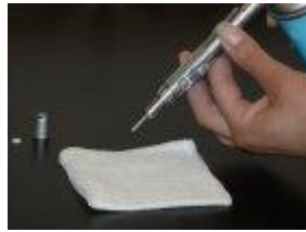
Spray closed with burr in